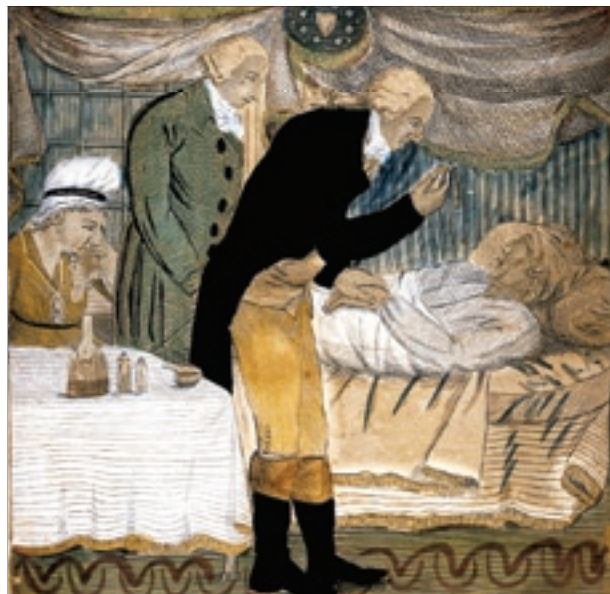
George Washington in His Last Illness, an etching done in 1800 by an unidentified artist, is an example of the public's fascination with the death of its first American hero.

Even though Washington's doctors did a lot of things that modern doctors would not do, they tried very hard to help him. They used medical practices that were believed to be the most helpful. Washington knew that he was very ill. He died bravely.