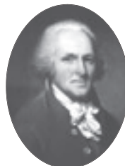
Charles Willson Peale, self-portrait, oil on canvas, circa 1791. National Portrait Gallery, Smithsonian Institution

fourth of a dollar, if only to see the huge American buffalo. Peale's rooms are filled with monsters of the earth and sea, a rich array of birds, and a great collection of the bones, jaws, and teeth of tigers, sharks, and many other fearful animals. In one room are rattle, black, and spotted snakes, confined in cases enclosed with wire and glass. She was astonished to see Mr. Peale take out a black snake about four or five feet long, which he permitted to touch his cheek and twine itself around his neck. In the yard and stable were eagles, owls, baboons, monkeys, and a six-footed cow. Mr. Peale is also a painter, and there can be seen in his museum more than a hundred portraits of the more noteworthy personages of our country, including our illustrious Washington.