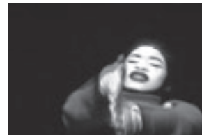
Billy's buddies help "Pledge It Forward" through flight, fantasy, and fun