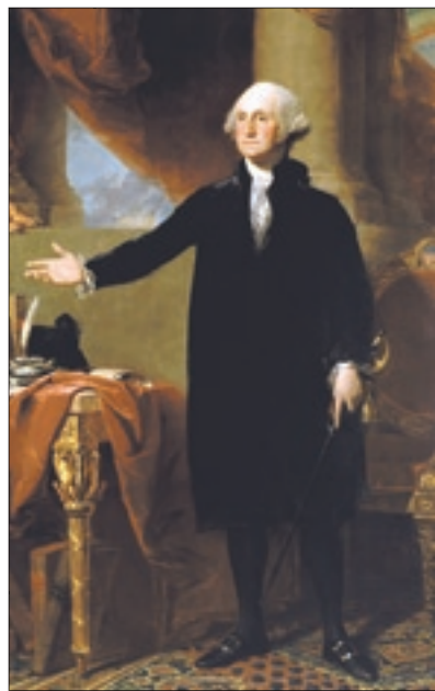
The National Portrait Gallery, Smithsonian Institution, acquired Gilbert Stuart's 1796 Lansdowne portrait of George Washington in 2001 as a gift to the nation through the generosity of the Donald W. Reynolds Foundation.

Next they were off to the show at George Elementary School. President Washington called for volunteers and taught the kids how to