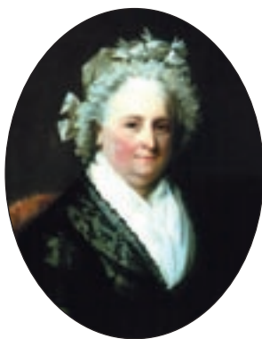
Martha Washington (above left) by an unidentified artist, after Gilbert Stuart and Charles Willson Peale, oil on canvas, 1800–1825. Abigail Adams (above right) by Raphaele Peale, hollow-cut silhouette, 1804. National Portrait Gallery, Smithsonian Institution

—a suggested title for the President of the United States, 1789