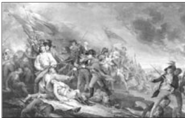
Battle of Bunker's Hill, near Boston (detail) by Johann Gotthard Von Müller, after John Trumbull, engraving, 1788–1797. National Portrait Gallery, Smithsonian Institution

“December 14—Prisoners & Deserters are continually coming in. The Army which has been surprisingly healthy hitherto, now begins to grow sickly from the continued fatigues they have suffered this Campaign. Yet they still show a spirit of Alacrity & Contentment not to be expected from so young Troops. I am Sick—discontented—and out of humour. Poor food—hard lodging—Cold Weather—fatigue—Nasty Cloaths—nasty Cookery—Vomit half my time—Smoak’d out of my senses [by the smoke created by the guns]—the Devil’s in it—I can’t Endure it—Why are we sent here to starve and Freeze—What sweet Felicities have I left at home; A charming Wife—pretty Children—Good Beds—good food—good Cookery—All agreeable—all harmonious. Here all Confusion—smoke & Cold—hunger & filthiness—a pox on my bad luck. There comes a bowl of beef soup—full of burnt leaves and dirt. . . . Away with it Boys—I’ll live like the Chameleon upon Air. Poh! Poh! Cries Patience within me—you talk like a fool. Your being Covers your mind with a Melancholic Gloom, which makes everything about you appear gloomy. See the poor Soldier, when in health—with what cheerfulness he meets his foes and encounters every