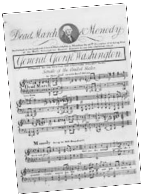
"Death March and Monody," sheet music, circa 1799-1800.

MRS. WASHINGTON'S DRAWING ROOM. On Friday evening at eight, your humble correspondent was among the ladies and gentlemen in attendance at Mrs. Washington's weekly reception. Mrs. Washington, plainly dressed, but in a gown of rich silk, sat on a sofa by the fireplace and arose to greet her guests with a curtsy which each lady returned. Each gentleman bowed low. Coffee, tea, and cake were served, and had I come in the summer, I would have been offered lemonade and ice cream. The ladies swish about, and as candlelight is a great improver of beauty, they appear to great advantage. President Washington circulated among the crowd, chatting agreeably with all the ladies. It is said that he keeps count of the numbers who come to pay their respects to Mrs. Washington and was pleased to find the room so crowded.