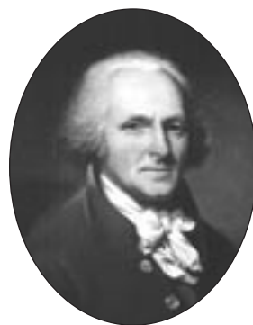
Charles Willson Peale, self-portrait, oil on canvas, circa 1791. National Portrait Gallery, Smithsonian Institution