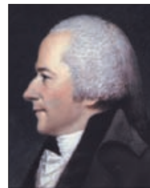
Thomas Jefferson (above left) by Mather Brown (detail), oil on canvas, 1786. Gift of Charles Francis Adams. Alexander Hamilton (above right) by James Sharples, pastel on paper, circa 1796. National Portrait Gallery, Smithsonian Institution