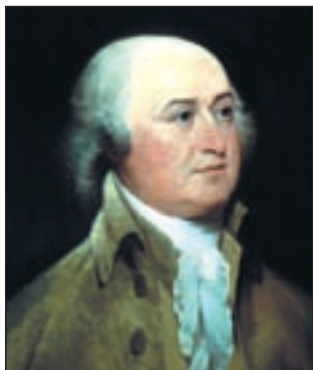
John Adams by John Trumbull (detail), oil on canvas, circa 1793. National Portrait Gallery, Smithsonian Institution

WHAT IS THE PRESIDENT TO BE CALLED? Debate, we are told, rages behind the closed doors of the Senate over a proper title for the President. Vice President John Adams and a number of the senators have insisted that a grand and high-sounding name, such as “Elective Excellency” or “Elective Highness,” is necessary to give respect to the office. Sources tell us that the committee appointed to draw up a list of titles “of all the Princes of the Earth” has recommended “His Highness the President of the United States of America, and Protector of their Liberties.” But the House of Representatives refuses to agree, and Mr. Washington will be simply called President of the United States. As one member of Congress told us, no other title was necessary to add to the respect the whole country had for General Washington.