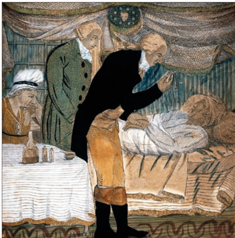
George Washington in His Last Illness, an etching done in 1800 by an unidentified artist, is an example of the public's fascination with the death of its first American hero.

During his whole illness he spoke but seldom, and with great difficulty; and in so low and broken a voice as at times hardly to be understood. His patience, fortitude, and resignation