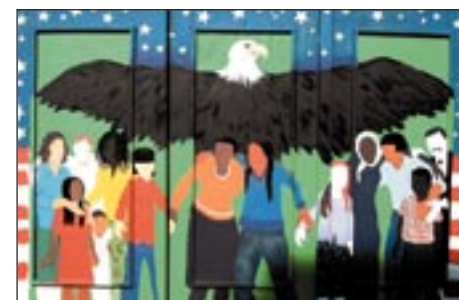
Dedicated to those who sacrificed and served on September 11, 2001, and the weeks following, the Wall of Expression surrounds the Old Patent Office Building at 8th and F Streets in Washington, D.C. The building, home of the National Portrait Gallery and the Smithsonian American Art Museum, is currently undergoing extensive renovation while its collections tour the world.

"George Washington: A National Treasure" is organized by the National Portrait Gallery, Smithsonian Institution, and made possible through the generosity of the Donald W. Reynolds Foundation.