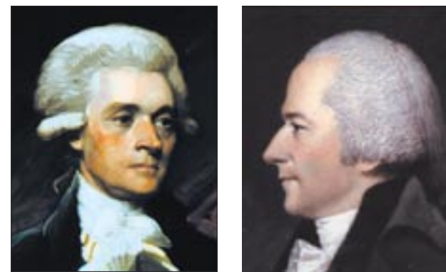
Thomas Jefferson (above left) by Mather Brown (detail), oil on canvas, 1786. Gift of Charles Francis Adams. Alexander Hamilton (above right) by James Sharples, pastel on paper, circa 1796. National Portrait Gallery, Smithsonian Institution

WHERE IS THE CAPITAL TO BE? Ever since the old Congress left Philadelphia in 1783, arguments have raged over where the permanent seat of government should be built. At last, the residence is decided. The government is to leave New York and spend the next ten years in Philadelphia. The permanent capital will be a new city created on the banks of the Potomac River, the exact location to be chosen by President Washington. Some folks speculate that it will not be far from Mount Vernon. New Yorkers, after they have gone to so much trouble and expense to accommodate the government, feel betrayed, and one angry letter to the editor speaks of the President as the country's “former favorite guardian and deliverer.”