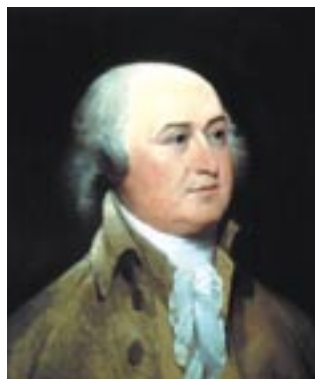
John Adams by John Trumbull (detail), oil on canvas, circa 1793. National Portrait Gallery, Smithsonian Institution

WHAT IS THE PRESIDENT TO BE CALLED? Debate, we are told, rages behind the closed doors of the Senate over a proper title for the President. Vice President John Adams and a number of the senators have insisted that a grand and high-sounding name, such as “Elective Excellency” or “Elective Highness,” is necessary to give respect to the office. Sources tell us that the committee appointed to draw up a list of titles “of all the Princes of the Earth” has recommended “His Highness the President of the United States of America, and Protector of their Liberties.” But the House of Representatives refuses to agree, and Mr. Washington will be simply called President of the United States. As one member of Congress told us, no other title was necessary to add to the respect the whole country had for General Washington.