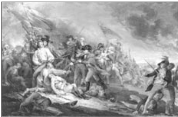
Battle of Bunker's Hill, near Boston (detail) by Johann Gotthard Von Müller, after John Trumbull, engraving, 1788–1797. National Portrait Gallery, Smithsonian Institution

VALLEY FORGE, 1777–1778—General Washington struggles to keep his troops alive and well in Valley Forge, Pennsylvania, this winter. Inadequate shipments of food, clothing, and supplies have left the regiments in shambles. Poor hygiene and serious disease threaten the lives of all the soldiers camped there. General Washington has appealed for more supplies, but has not been successful. In the meantime, General Washington struggles alongside his men, while his political enemies threaten to remove his power. Some critics feel that others are better suited to lead the Continental army.