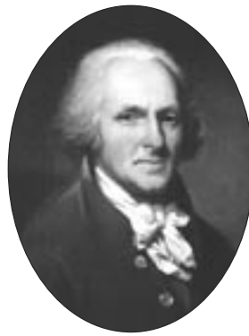
Charles Willson Peale, self-portrait, oil on canvas, circa 1791. National Portrait Gallery, Smithsonian Institution