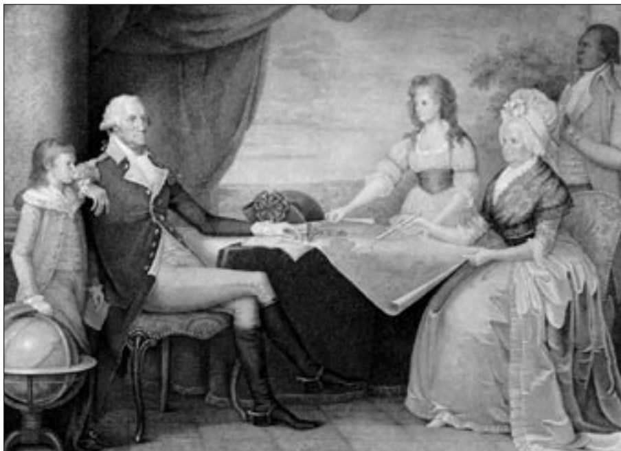
George Washington and His Family by David Edwin, after Edward Savage, stipple engraving, 1798.

PRESIDENTIAL RESIDENCE, 190 HIGH STREET, PHILADELPHIA. Senator Robert Morris’s dwelling, at 190 High Street, has turned out to be the best house available for the President’s use, and Mr. Morris has graciously agreed to move around the corner. Additions will be made to accommodate Mrs. Washington and her two grandchildren, Nelly, who is about twelve, and George Washington, who is about ten, as well as the President’s secretary and numerous servants. The bathing room has been turned into a study to provide for a room in which the President can do business, but unfortunately it will be necessary for visitors to walk up two flights of stairs and pass by the public rooms and private chambers to get to it. The President has insisted that the house is to be finished in a plain and neat manner and has ruled out tapestry or very rich and costly wallpaper. He has also ruled that the back yard be kept as clean as the parlor, since it is in full view from the best rooms in the house.