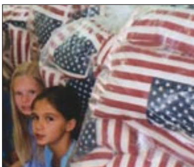
Lots of patriotic pillows!