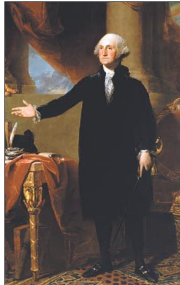
The National Portrait Gallery, Smithsonian Institution, acquired Gilbert Stuart's 1796 Lansdowne portrait of George Washington in 2001 as a gift to the nation through the generosity of the Donald W. Reynolds Foundation.