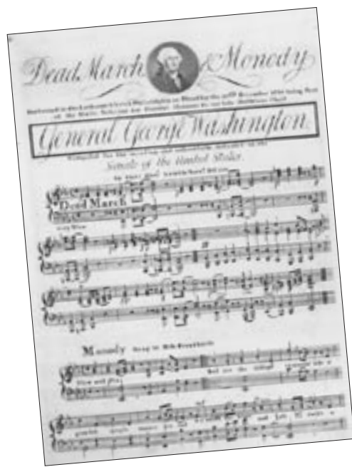
"Death March and Monody," sheet music, circa 1799-1800.

MRS. WASHINGTON'S DRAWING ROOM. On Friday evening at eight, your humble correspondent was among the ladies and gentlemen in attendance at Mrs. Washington's weekly reception. Mrs. Washington, plainly dressed, but in a gown of rich silk, sat on a sofa by the fireplace and arose to greet her guests with a curtsy which each lady returned. Each gentleman bowed low. Coffee, tea, and cake were served, and had I come in the summer, I would have been offered lemonade and ice cream. The ladies swish about, and as candlelight is a great improver of beauty, they appear to great advantage. President Washington circulated among the crowd, chatting agreeably with all the ladies. It is said that he keeps count of the numbers who come to pay their respects to Mrs. Washington and was pleased to find the room so crowded.