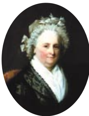
Martha Washington (above left) by an unidentified artist, after Gilbert Stuart and Charles Willson Peale, oil on canvas, 1800-1825. Abigail Adams (above right) by Raphaelle Peale, hollow-cut silhouette, 1804.

—a suggested title for the President of the United States, 1789