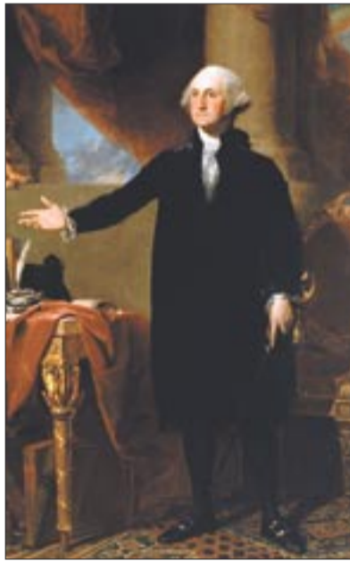
The National Portrait Gallery, Smithsonian Institution, acquired Gilbert Stuart's 1796 Lansdowne portrait of George Washington in 2001 as a gift to the nation through the generosity of the Donald W. Reynolds Foundation.