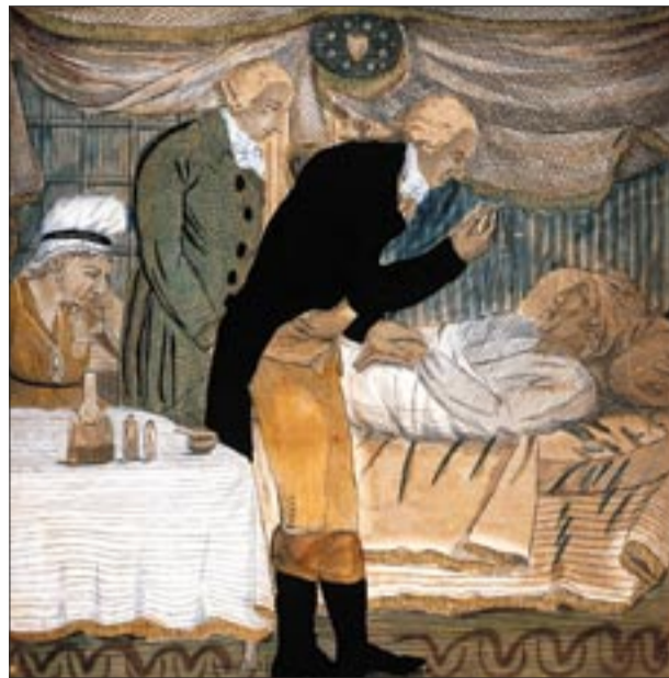
George Washington in His Last Illness, an etching done in 1800 by an unidentified artist, is an example of the public's fascination with the death of its first American hero.

During his whole illness he spoke but seldom, and with great difficulty; and in so low and broken a voice as at times hardly to be understood. His patience, fortitude, and resignation