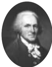
Charles Wilson Peale, self-portrait, oil on canvas, circa 1791.

PEALE'S MUSEUM. A visit to Mr. Peale's museum, Prudence Pudding tells us, is well worth the admission fee of one fourth of a dollar, if only to see the huge American buffalo. Peale's rooms are filled with monsters of the earth and sea, a rich array of birds, and a great collection of the bones, jaws, and teeth of tigers, sharks, and many other fearful animals. In one room are rattle, black, and spotted snakes, confined in cases enclosed with wire and glass. She was astonished to see Mr. Peale take out a black snake about four or five feet long which he permitted to touch his cheek and twine itself around his neck. In the yard and stable were eagles, owls, baboons, monkeys, and a six-footed cow. Mr. Peale is also a painter, and there can be seen in his museum more than a hundred portraits of the more noteworthy personages of our country, including our illustrious Washington.