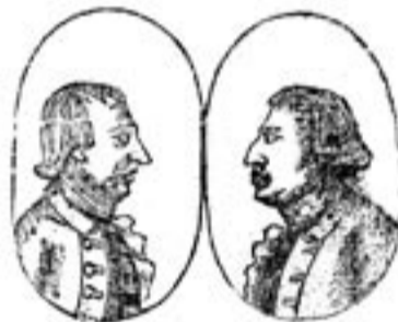
The Glorious Washington and Gates, detail from Bickerstaff's Boston Almanack, 1778

VALLEY FORGE, 1777–1778—General Washington struggles to keep his troops alive and well in Valley Forge, Pennsylvania, this winter. Inadequate shipments of food, clothing, and supplies have left the regiments in shambles; poor hygiene and rampant disease threaten the lives of all the soldiers camped there. General Washington has made repeated appeals for increased supplies, but the mismanagement of the supply trade has yet to be resolved. In the meantime, General Washington struggles alongside his men while political rivals threaten to remove his power. Military and civilian critics, particularly Thomas Conway and Dr. Benjamin Rush, feel that there are several men who are better suited to lead the Continental army.