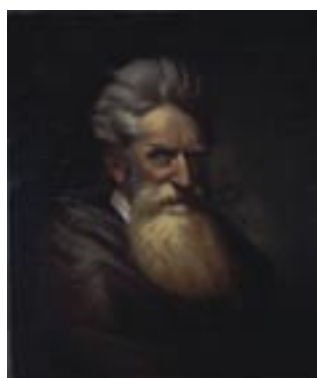
John Brown by Ole Peter Hansen Balling, oil on canvas, 1873

Poet Stephen Vincent Benét captures the tragedy of the Civil War for all Americans in his soon-to-be-published poem "John Brown's Body." Simultaneously slated for publication by Rinehart and Co. in New York and by Clark, Irwin, and Co. in Toronto, this harrowing account eerily depicts the defeat at Harpers Ferry: