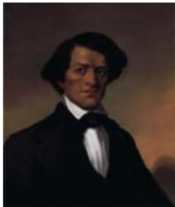
Frederick Douglas by an unidentified artist, oil on canvas, c. 1844

Frederick Douglass stood at the podium, trembling with nervousness. Before him sat abolitionists who had traveled to the Massachusetts island of Nantucket. Only 23 years old at the time, Douglass overcame his anxiety and gave a stirring, eloquent speech about his life as a slave. Douglass would continue to give speeches for the rest of his life and would become a leading spokesperson for the abolition of slavery and for racial equality.