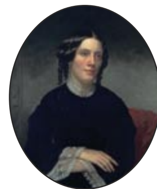
Harriet Beecher Stowe by Alanson Fisher, oil on canvas, 1853

First published in weekly installments from June 5, 1851, to April 1852 in the journal National Era , Harriet Beecher Stowe’s novel about the horrors of slavery sold 300,000 copies within a year of publication. It caused such controversy that