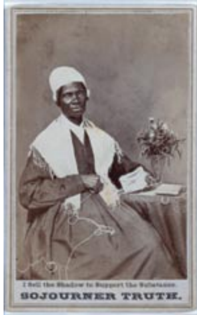
Sojourner Truth by an unidentified artist, albumen silver print, 1864

The controversial Truth has both shocked and electrified audiences at recent abolitionist events in the Northeast. The statuesque Truth stands six feet tall, with a powerful frame. In response to the jeers of hecklers who protested that she was "too forceful to be a woman,"