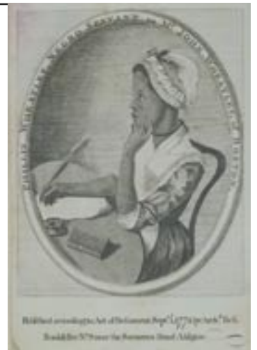
Phillis Wheatley by an unidentified artist, engraving, 1773

I, young in life, by seeming cruel fate Was snatch'd from Afric's fancy'd happy seat: What pangs excruciating must molest, What sorrows labour in my parent's breast? Steel'd was that soul and by no misery mov'd That from a father seiz'd his babe below'd: Such, such my case. And can I then but pray Others may never feel tyrannic sway?