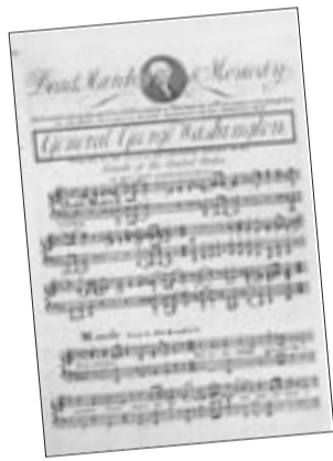
"Death March and Monody," sheet music, circa 1799-1800.

MRS. WASHINGTON'S DRAWING ROOM. On Friday evening at eight, your humble correspondent was among the ladies and gentlemen in attendance at Mrs. Washington's weekly reception. Mrs. Washington, plainly dressed, but in a gown of rich silk, sat on a sofa by the fireplace and arose to greet her guests with a curtsy which each lady returned. Each gentleman bowed low. Coffee, tea, and cake were served, and had I come in the summer, I would have been offered lemonade and ice cream. The ladies swish about, and as candlelight is a great improver of beauty, they appear to great advantage. President Washington circulated among the crowd, chatting agreeably with all the ladies. It is said that he keeps count of the numbers who come to pay their respects to Mrs. Washington and was pleased to find the room so crowded.