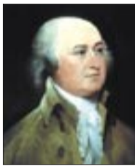
John Adams by John Trumbull (detail), oil on canvas, circa 1793. National Portrait Gallery, Smithsonian Institution

WHAT IS THE PRESIDENT TO BE CALLED? Debate, we are told, rages behind the closed doors of the Senate over a proper title for the President. Vice President John Adams and a number of the senators have insisted that a grand and high-sounding name, such as “Elective Excellency” or “Elective Highness,” is necessary to give respect to the office. Sources tell us that the committee appointed to draw up a list of titles “of all the Princes of the Earth” has recommended “His Highness the President of the United States of America, and Protector of their Liberties.” But the House of Representatives refuses to agree, and Mr. Washington will be simply called President of the United States. As one member of Congress told us, no other title was necessary to add to the respect the