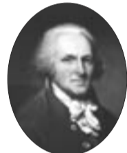
Charles Wilson Peale, self-portrait, oil on canvas, circa 1791. National Portrait Gallery, Smithsonian Institution

RICKETTS'S AMPHITHEATRE. Word that the President and his family were to attend a performance of Mr. John Bill Ricketts's dangerous feats on horseback brought a large crowd this evening to what is called the Circus. The acrobatic performance was held to raise money to buy firewood for the poor during the coming winter. Mr. Ricketts, demonstrating his agility by drinking a glass of wine while on horseback, raised his glass to the health of "The Man of the People." This produced an immediate clap of applause and a loud hurrah from every part of the Circus. Mr. Ricketts has expressed his agreement with those who call General Washington the finest horseman of the age, saying "I delight to see the general ride, and make it a point to fall in with him when I hear that he is abroad on horseback; his seat is so firm, his management so easy and graceful, that I who am a professor of horsemanship, would go to him and learn to ride."