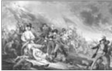
Battle of Bunker's Hill, near Boston (detail) by Johann Gotthard Von Müller, after John Trumbull, engraving, 1788–1797. National Portrait Gallery, Smithsonian Institution

"December 14—Prisoners & Deserters are continually coming in. The Army which has been surprisingly healthy hitherto, now begins to grow sickly from the continued fatigues they have suffered this Campaign. Yet they still show a spirit of Alacrity & Contentment not to be expected from so young Troops. I am Sick—discontented—and out of humour. Poor food—hard lodging—Cold Weather—fatigue—Nasty Cloaths—nasty Cookery—Vomit half my time—Smoak'd out of my senses [by the smoke created by the guns]—the Devil's in it—I can't Endure it—Why are we sent here to starve and Freeze—What sweet Felicities have I left at home; A charming Wife—pretty Children—Good Beds—good food—good Cookery—All agreeable—all harmonious. Here all Confusion—smoke & Cold—hunger & filthiness—a pox on my bad luck. There comes a bowl of beef soup—full of burnt leaves and dirt. . . . Away with it Boys—I'll live like the Chameleon upon Air. Poh! Poh! Cries Patience within me—you talk like a fool. Your being Covers your mind with a Melancholic Gloom, which makes everything about you appear gloomy. See the poor Soldier, when in health—with what cheerfulness he meets his foes and encounters every