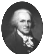
Charles Wilson Peale, self-portrait, oil on canvas, circa 1791.