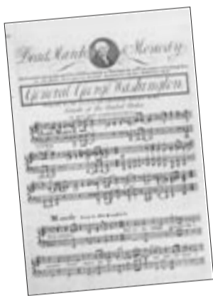
"Death March and Monody," sheet music, circa 1799-1800. National Portrait Gallery, Smithsonian Institution

MRS. WASHINGTON'S DRAWING ROOM. On Friday evening at eight, your humble correspondent was among the ladies and gentlemen in attendance at Mrs. Washington's weekly reception. Mrs. Washington, plainly dressed, but in a gown of rich silk, sat on a sofa by the fireplace and arose to greet her guests with a curtsy which each lady returned. Each gentleman bowed low. Coffee, tea, and cake were served, and had I come in the summer, I would have been offered lemonade and ice cream. The ladies swish about, and as candlelight is a great improver of beauty, they appear to great advantage. President Washington circulated among the crowd, chatting agreeably with all the ladies. It is said that he keeps count of the numbers who come to pay their respects to Mrs. Washington and was pleased to find the room so crowded.