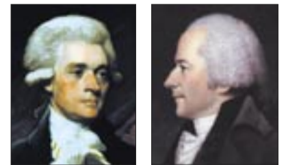
Thomas Jefferson (above left) by Mather Brown (detail), oil on canvas, 1786. Gift of Charles Francis Adams. Alexander Hamilton (above right) by James Sharples, pastel on paper, circa 1796.

—a suggested title for the President of the United States, 1789