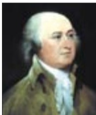
John Adams by John Trumbull (detail), oil on canvas, circa 1793.

WHAT IS THE PRESIDENT TO BE CALLED? Debate, we are told, rages behind the closed doors of the Senate over a proper title for the President. Vice President John Adams and a number of the senators have insisted that a grand and high-sounding name, such as “Elective Excellency” or “Elective Highness,” is necessary to give respect to the office. Sources tell us that the committee appointed to draw up a list of titles “of all the Princes of the Earth” has recommended “His Highness the President of the United States of America, and Protector of their Liberties.” But the House of Representatives refuses to agree, and Mr. Washington will be simply called President of the United States. As one member of Congress told us, no other title was necessary to add to the respect the whole country had