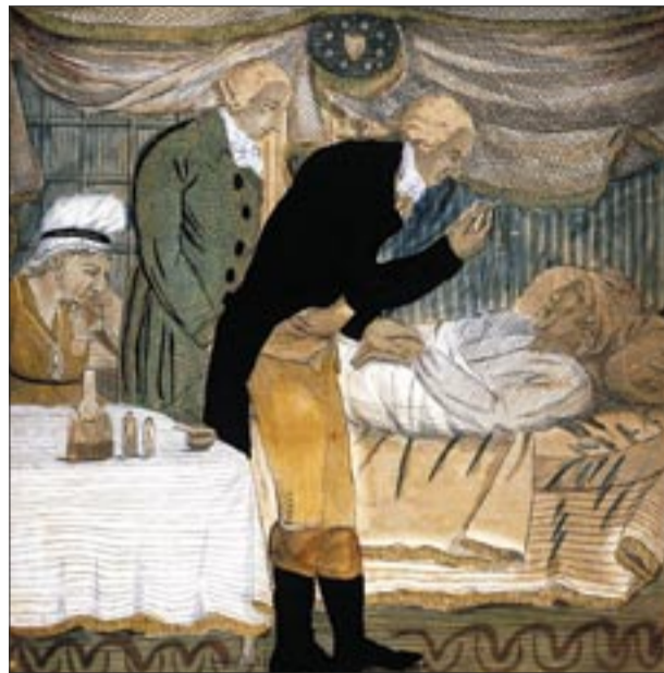
George Washington in His Last Illness, an etching done in 1800 by an unidentified artist, is an example of the public's fascination with the death of its first American hero.

During his whole illness he spoke but seldom, and with great difficulty; and in so low and broken a voice as at times hardly to be understood. His patience, fortitude, and resignation