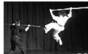
Billy's buddies help "Pledge It Forward" through flight, fantasy, and fun

To help with the considerable cost of this long-distance therapy, the teachers and most of the school's 1,200 students at Red Land High thought of a way to "Pledge It Forward" and help out. Under the direction of teacher Alison Gonce, the students mounted a talent show like no other. When the call went out for auditions, everyone answered. Seventy-two students in 42 acts auditioned, 25