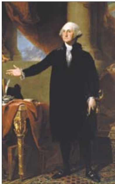
The National Portrait Gallery, Smithsonian Institution, acquired Gilbert Stuart's 1796 Lansdowne portrait of George Washington in 2001 as a gift to the nation through the generosity of the Donald W. Reynolds Foundation.