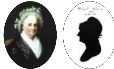
Martha Washington (above left) by an unidentified artist, after Gilbert Stuart and Charles Willson Peale, oil on canvas, 1800–1825. Abigail Adams (above right) by Raphaelle Peale, hollow-cut silhouette, 1804. National Portrait Gallery, Smithsonian Institution

HE COMES! HE COMES! George Washington, President-elect of the United States, has just set foot on the New York shore after an eight-day triumphal journey from Mount Vernon. The excitement here is unbelievable. Thousands line the streets—all you can see are heads standing as thick as ears of corn before the harvest. Ladies are crowded in every window, anxious for a glimpse of the illustrious man. “I have seen him!” we heard one young lady call out, “and though I had been entirely ignorant that he was arrived in the city, I should have known at a glance that it was General Washington: I never saw a human being that looked so great and noble as he does. I could fall down on my knees before him.” Washington, it can well be believed, is more popular than the new government he is to head.