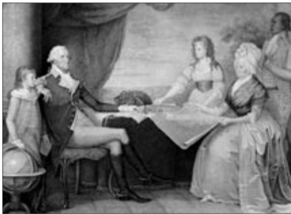
George Washington and His Family by David Edwin, after Edward Savage, stipple engraving, 1798. National Portrait Gallery, Smithsonian Institution

PRESIDENTIAL RESIDENCE, 190 HIGH STREET, PHILADELPHIA. Senator Robert Morris's dwelling, at 190 High Street, has turned out to be the best house available for the President's use, and Mr. Morris has graciously agreed to move around the corner. Additions will be made to accommodate Mrs. Washington and her two grandchildren, Nelly, who is about twelve, and George Washington, who is about ten, as well as the President's secretary and numerous servants. The bathing room has been turned into a study to provide for a room in which the President can do business, but unfortunately it will be necessary for visitors to walk up two flights of stairs and pass by the public rooms and private chambers to get to it. The President has insisted that the house is to be finished in a plain and neat manner and has ruled out tapestry or very rich and costly wallpaper. He has also ruled that the backyard be kept as clean as the parlor, since it is in full view from the best rooms in the house.