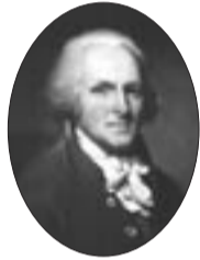
Charles Wilson Peale, self-portrait, oil on canvas, circa 1791. National Portrait Gallery, Smithsonian Institution