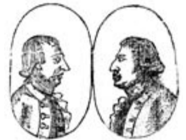
The Glorious Washington and Gates , detail from Bickerstaff's Boston Almanack, 1778