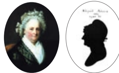
Martha Washington (above left) by an unidentified artist, after Gilbert Stuart and Charles Wilson Peale, oil on canvas, 1800-1825. Abigail Adams (above right) by Raphaelle Peale, hollow-cut silhouette, 1804.

HE COMES! HE COMES! George Washington, President-elect of the United States, has just set foot on the New York shore after an eight-day triumphal journey from Mount Vernon. The excitement here is unbelievable. Thousands line the streets—all you can see are heads standing as thick as ears of corn before the harvest. Ladies are crowded in every window, anxious for a glimpse of the illustrious man. “I have seen him!” we heard one young lady call out, “and though I had been entirely ignorant that he was arrived in the city, I should have known at a glance that it was General Washington: I never saw a human being that looked so great and noble as he does. I could fall down on my knees before him.” Washington, it can well be believed, is more popular than the new government he is to head.