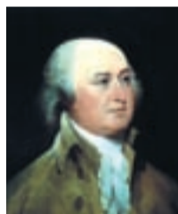
John Adams by John Trumbull (detail), oil on canvas, circa 1793. National Portrait Gallery, Smithsonian Institution

WHAT IS THE PRESIDENT TO BE CALLED? Debate, we are told, rages behind the closed doors of the Senate over a proper title for the President. Vice President John Adams and a number of the senators have insisted that a grand and high-sounding name, such as “Elective Excellency” or “Elective Highness,” is necessary to give respect to the office. Sources tell us that the committee appointed to draw up a list of titles “of all the Princes of the Earth” has recommended