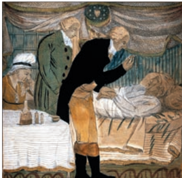
George Washington in His Last Illness, an etching done in 1800 by an unidentified artist, is an example of the public's fascination with the death of its first American hero.

An elaborate funeral is planned for Wednesday, December 18, including gun salutes and a procession.