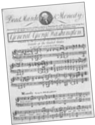
"Death March and Monody," sheet music, circa 1799-1800. National Portrait Gallery, Smithsonian Institution

MRS. WASHINGTON'S DRAWING ROOM. On Friday evening at eight, your humble correspondent was among the ladies and gentlemen in attendance at Mrs. Washington's weekly reception. Mrs. Washington, plainly dressed, but in a gown of rich silk, sat on a sofa by the fireplace and arose to greet her guests with a curtsy which each lady returned. Each gentleman bowed low. Coffee, tea, and cake were served, and had I come in the summer, I would have been offered lemonade and ice cream. The ladies swish about, and as candlelight is a great improver of beauty, they appear to great advantage. President Washington circulated among the crowd, chatting agreeably with all the ladies. It is said that he keeps count of the numbers who come to pay their respects to Mrs. Washington and was pleased to find the room so crowded.