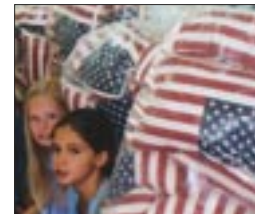
Lots of patriotic pillows!