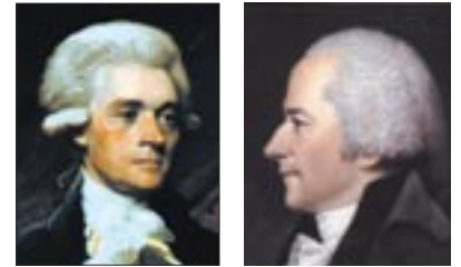
Thomas Jefferson (above left) by Mather Brown (detail), oil on canvas, 1786. Gift of Charles Francis Adams. Alexander Hamilton (above right) by James Sharples, pasted on paper, circa 1796.

*Editor’s note—We apologize in advance for any improprieties, insults, or slanderous remarks on the part of our correspondents. They are, at times ill-mannered, sometimes indiscreet, and, at all times, swart of wit.