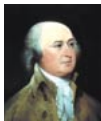
John Adams by John Trumbull (detail), oil on canvas, circa 1793. National Portrait Gallery, Smithsonian Institution

WHAT IS THE PRESIDENT TO BE CALLED? Debate, we are told, rages behind the closed doors of the Senate over a proper title for the President. Vice President John Adams and a number of the senators have insisted that a grand and high-sounding name, such as “Elective Excellency” or “Elective Highness,” is necessary to give respect to the office. Sources tell us that the committee appointed to draw up a list of titles “of all the Princes of the Earth” has recommended “His Highness the President of the United States of America, and Protector of their Liberties.” But the House of Representatives refuses to agree, and Mr. Washington will be simply called President of the United States. As one member of Congress told us, no other title was necessary to add to the respect the whole country had for General Washington.