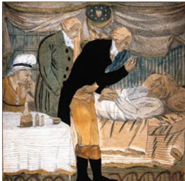
George Washington in His Last Illness, an etching done in 1800 by an unidentified artist, is an example of the public's fascination with the death of its first American hero.

An elaborate funeral is planned for Wednesday, December 18, including gun salutes and a procession.