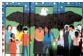
Dedicated to those who sacrificed and served on September 11, 2001, and the weeks following, the Wall of Expression surrounds the Old Patent Office Building at 8th and F Streets in Washington, D.C. The building, home of the National Portrait Gallery and the Smithsonian American Art Museum, is currently undergoing extensive renovation while its collections tour the world.

“George Washington: A National Treasure” is organized by the National Portrait Gallery, Smithsonian Institution, and made possible through the generosity of the Donald W. Reynolds Foundation.