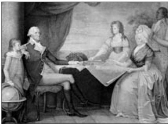
George Washington and His Family by David Edwin, after Edward Savage, stipple engraving, 1798. National Portrait Gallery, Smithsonian Institution