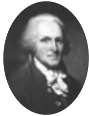
Charles Wilson Peale, self-portrait, oil on canvas, circa 1791. National Portrait Gallery, Smithsonian Institution

PEALE'S MUSEUM. A visit to Mr. Peale's museum, Prudence Pudding tells us, is well worth the admission fee of one fourth of a dollar, if only to see the huge American buffalo. Peale's rooms are filled with monsters of the earth and sea, a rich array of birds, and a great collection of the bones, jaws, and teeth of tigers, sharks, and many other fearful animals. In one room are rattle, black, and spotted snakes, confined in cases enclosed with wire and glass. She was astonished to see Mr. Peale take out a black snake about four or five feet long which he permitted to touch his cheek and twine itself around his neck. In the yard and stable were eagles, owls, baboons, monkeys, and a six-footed cow. Mr. Peale is also a painter, and there can be seen in his museum more than a hundred portraits of the more noteworthy personages of our country, including our illustrious Washington.