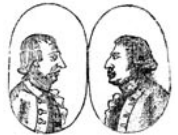
The Glorious Washington and Gates , detail from Bickerstaff's Boston Almanack, 1778

PHILADELPHIA, 1794—Western Pennsylvanians have started a violent opposition to government taxes. They are launching the first major civil disturbance of President Washington's term in office. Last week, U.S. Marshal David Lenox was trying to collect taxes on locally distilled liquor in Westmoreland County. Military action will be taken, much to the regret of the President: "I have accordingly determined to do so, feeling the deepest regret for the occasion, but withal, the most solemn conviction, that the essential interests of the Union demand it." The army is being organized from other northern states and they will advance into Pennsylvania shortly.