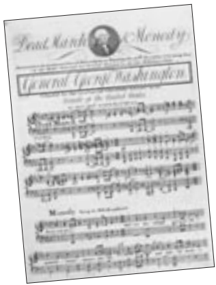
"Death March and Monody," sheet music, circa 1799-1800.

MRS. WASHINGTON'S DRAWING ROOM. On Friday evening at eight, your humble correspondent was among the ladies and gentlemen in attendance at Mrs. Washington's weekly reception. Mrs. Washington, plainly dressed, but in a gown of rich silk, sat on a sofa by the fireplace and arose to greet her guests with a curtsy which each lady returned. Each gentleman bowed low. Coffee, tea, and cake were served, and had I come in the summer, I would have been offered lemonade and ice cream. The ladies swish about, and as candlelight is a great improver of beauty, they appear to great advantage. President Washington circulated among the crowd, chatting agreeably with all the ladies. It is said that he keeps count of the numbers who come to pay their respects to Mrs. Washington and was pleased to find the room so crowded.