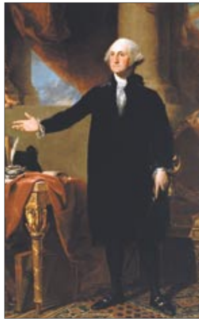
The National Portrait Gallery, Smithsonian Institution, acquired Gilbert Stuart’s 1796 Lansdowne portrait of George Washington in 2001 as a gift to the nation through the generosity of the Donald W. Reynolds Foundation.