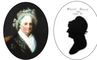
Martha Washington (above left) by an unidentified artist, after Gilbert Stuart and Charles Wilson Peale, oil on canvas, 1800-1825. Abigail Adams (above right) by Raphaelle Peale, hollow-cut silhouette, 1804.

HE COMES! HE COMES! George Washington, President-elect of the United States, has just set foot on the New York shore after an eight-day triumphal journey from Mount Vernon. The excitement here is unbelievable. Thousands line the streets—all you can see are heads standing as thick as ears of corn before the harvest. Ladies are crowded in every window, anxious for a glimpse of the illustrious man. “I have seen him!” we heard one young lady call out, “and though I had been entirely ignorant that he was arrived in the city, I should have known at a glance that it was General Washington: I never saw a human being that looked so great and noble as he does. I could fall down on my knees before him.” Washington, it can well be believed, is more popular than the new government he is to head.